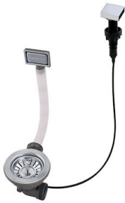
Automatic waste fitting - PM 8407 113